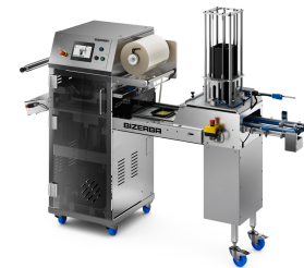
Tray sealer TPC15

Tray sealer TPC15 is intended for fully automatic tray sealing and packaging with MAP (modified protective atmosphere). The TPC15 is suitable for a wide variety of packaging types and sizes and significantly increases shelf life of food products. A tool-free change of sealing mold and tray denester provides the flexibility needed to respond quickly and easily to changing customer requirements in terms of packaging type and size. Additional molds and tray holders can be simply stored in an optional heatable mold holder trolley, from where they can be easily removed and quickly inserted in the machine as needed. With Bizerba's slicing, inspection and labeling solutions you can combine a compact and fully automatic line solution based on your individual needs.