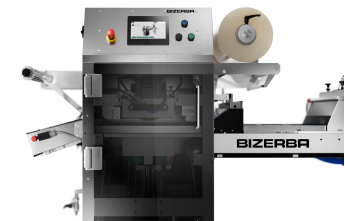
Automatic tray sealing