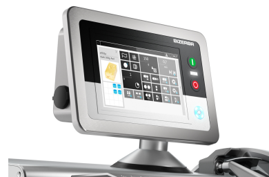
Touch screen with customizable menu structure